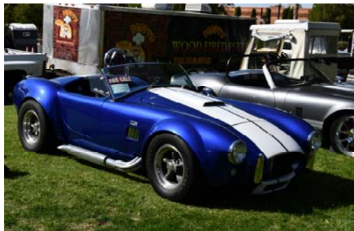
I wonder if he know that Shelby used a British car to stuff that 427 in?