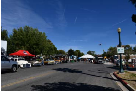
Boulder City, a truly gracious host for the Wurstfest car show 2018

BY STANLEY PEPELINSKI