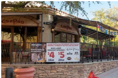
From wine pairing to a pair of beers out at The Pub at Lake Las Vegas