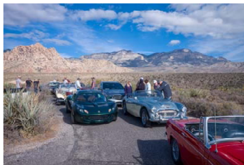
British traffic jam at the viewpoint, wonderful view from some great cars

We pulled off at Red Rock Wash, a nice loop