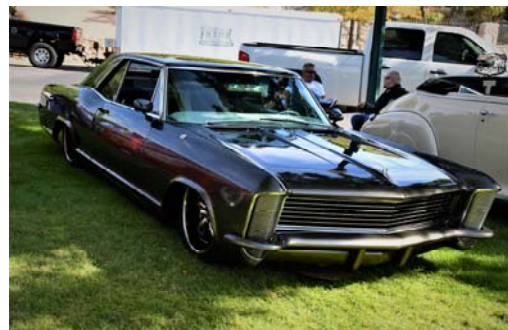
A little American muscle, beautiful restoration gleaming in the afternoon sun

naissance parties went out to search for the ultimate automotive wonder. All returned. Some with tales of a nice Austin-Healey 3000 yet to join the club and a Jaguar XK-E type (12 cylinder) that sat apart and forlorn (doubt the owner felt that way). Mostly there were tales of amazing restorations of cars from our youth (true classics there), hot rods