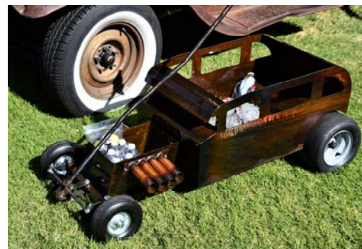
Al you're trading in your Jag for a what?

By early afternoon, it was apparent that the battle lines had blurred, perhaps that was more the result of the beer than any anticipated animosity. After such a tense day, it was time to retreat to Milo's Wine Bar for a little recuperation and debrief on the day's events. After an hour or two of intense examination and introspection, the day came to an end. Those few survivors once again retreated down the hill only to gather and surge forward yet another day.