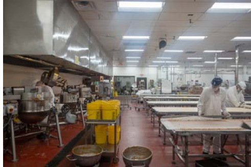
Rows upon rows of Snickers bars, hand made and wanting to be eaten