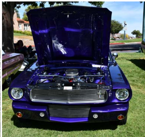
Better than new, a Mustang shining in the afternoon sun, polished, painted and chromed, amazing even if it isn't British