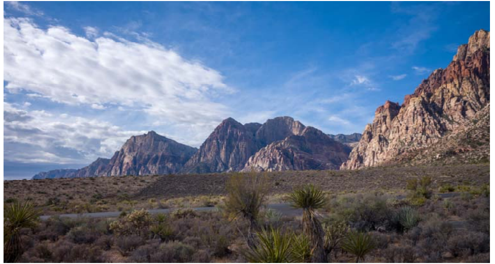
What Red Rock is all about, thanks Hap